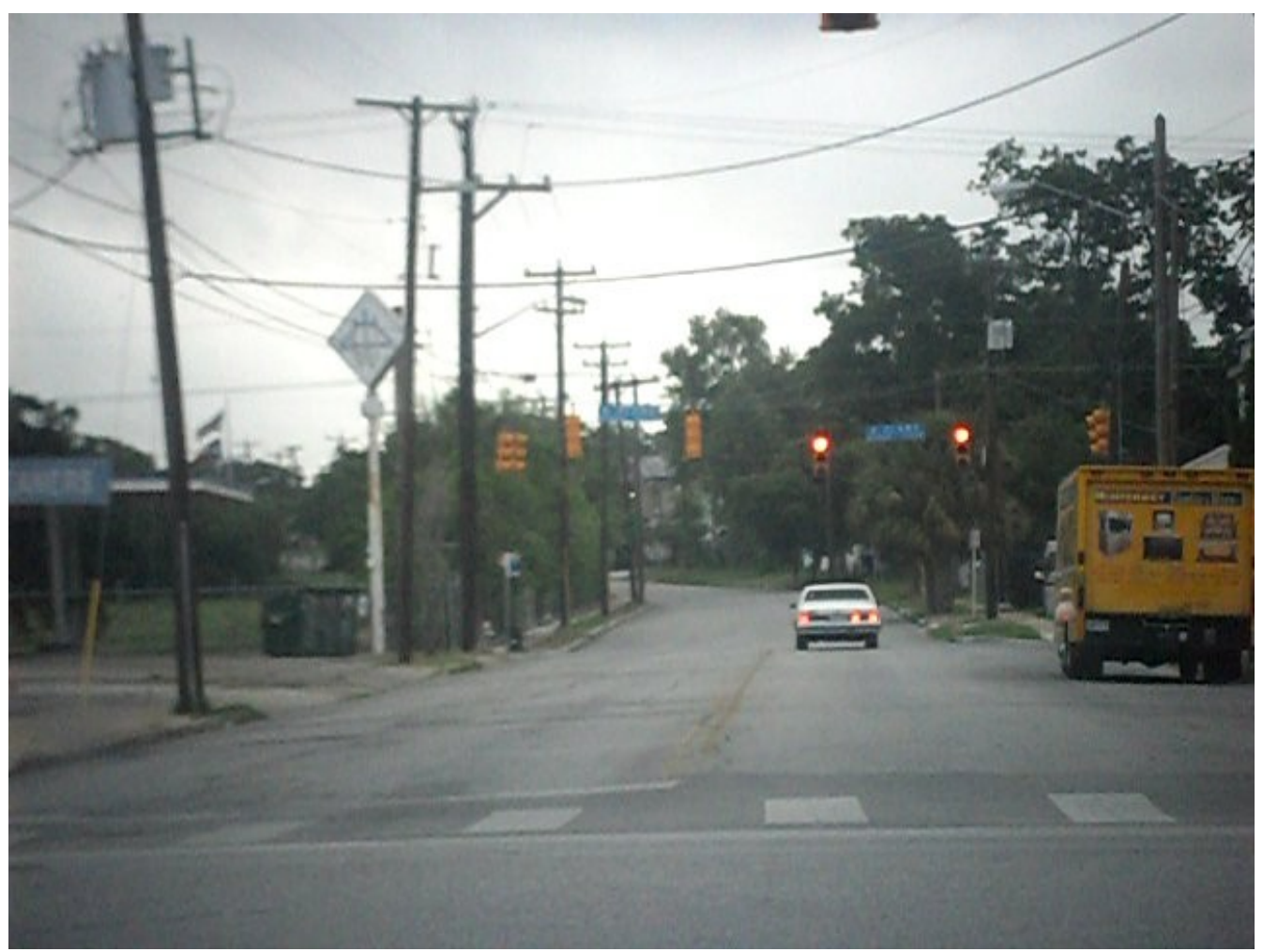
Also, I seem to get the most trouble at Brackenridge Park on Saturdays.

~7:10am Reached the corner of Josephine and Broadway, near Brackenridge Park. When I reached the intersection, I noticed the same vehicle waiting across the street, with a missing left taillight, that was waiting at this same intersection, the moment I arrived, the previous week. If I encounter this vehicle in the same place again, I'll try to get a license plate.